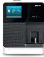
Samsung LABGEO HC10 HEMATOLOGY ANALYZER

Thermo Fisher Scientific is the global collaboration partner of Samsung for commercialization and co-development of innovative solutions in the POC testing market. Together we provide excellent expertise in clinical diagnostics to fulfill customer needs and improve patient management.