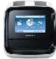
Samsung LABGEO IB10 IMMUNOASSAY ANALYZER