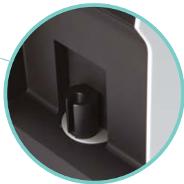
Auto Sample Loader